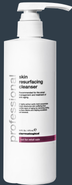
Skin Resurfacing Cleanser