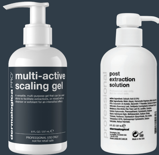
Multi-Active Scaling Gel