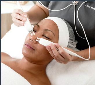
Microcurrent Specific Iontophoresis on Negative