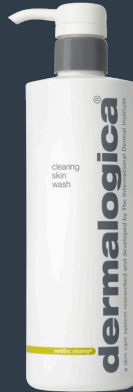
Clearing Skin Wash