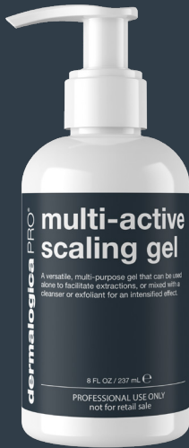
Multi-Active Scaling Gel